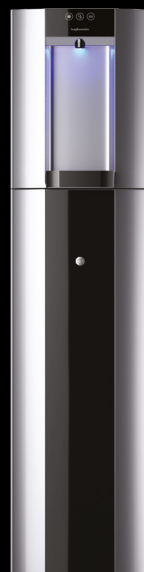
Silver - Floorstanding