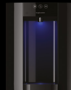
Black - Countertop