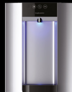
Silver - Countertop

Installation Kit with 3M Filter Filtration and hygiene assurance with Biomaster.